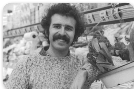
"Psst! Wanna buy some healthy greens?" Me, 1972.

I hope that our next 40 years will be as exciting and productive as our first 40.