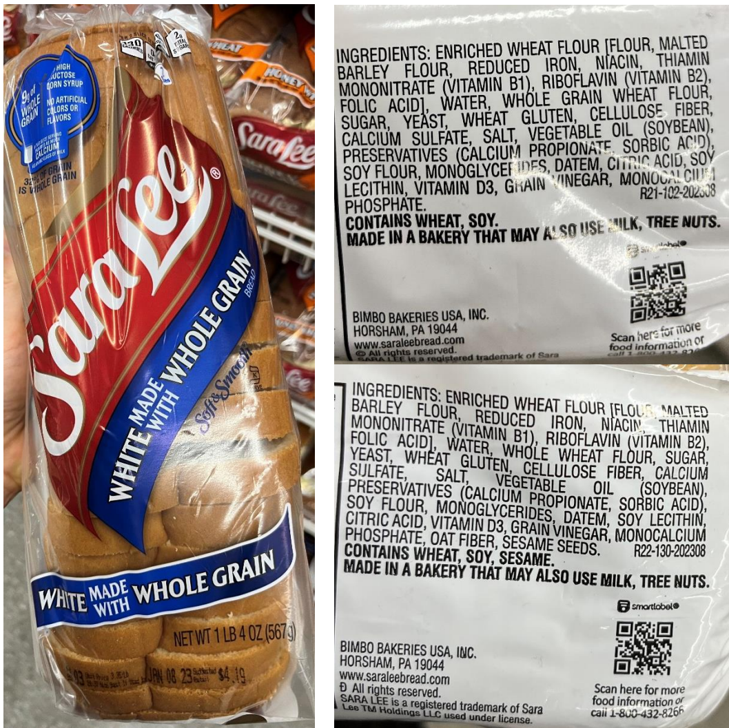
Figure 3: Sara Lee White Made with Whole Grain Bread, prior to and after the declaration of sesame seeds as the last ingredient.

In another example, Sara Lee White Made with Whole Grain Bread, manufactured by Bimbo Bakeries USA, the largest commercial baking company in the United States, 24 did not previously declare sesame in its ingredients or PAL statement, or include a complex ingredient like “spice” or “natural flavors” that could have contained sesame as a component, yet versions of the product are now appearing at retail with “sesame seeds” listed as the last ingredient. (Fig 3)