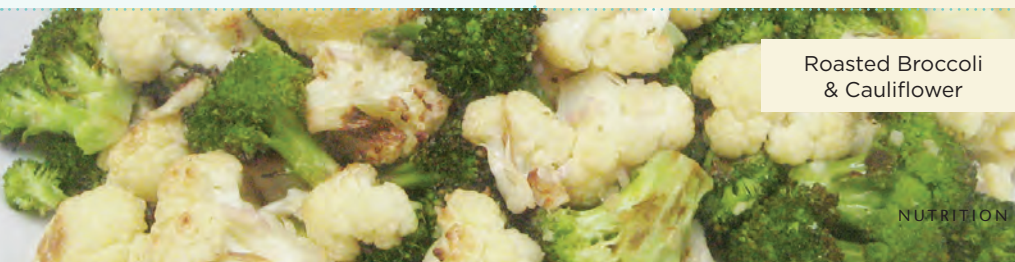
Roasted Broccoli &amp; Cauliflower