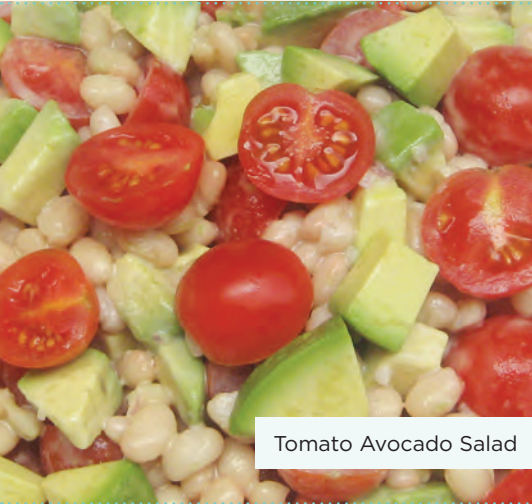
Tomato Avocado Salad

Work more beans and vegetables onto your plate. That's easy for us to say. Now it's easy for you to do. These simple dishes let you go from "I'm hungry" to "Dinner is served" in minutes.