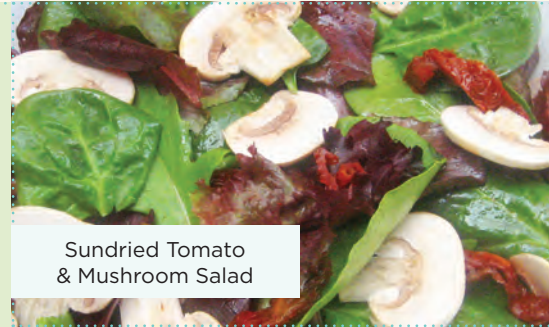
Sundried Tomato &amp; Mushroom Salad