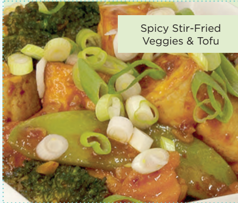
Spicy Stir-Fried Veggies &amp; Tofu