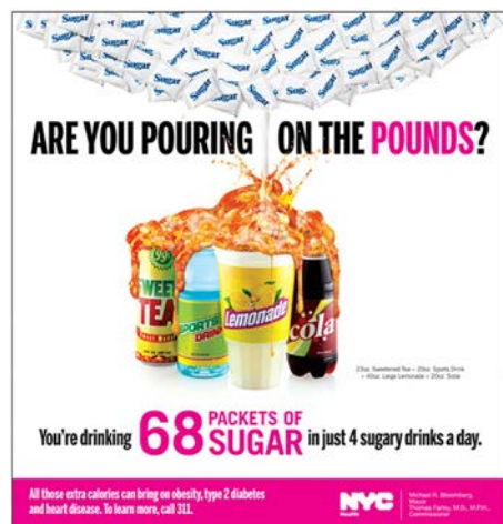
Part of the New York City Health Department's campaign to fight obesity.

They also use municipal water in their bottled water. They run it through a filter, but it's no cleaner than tap water.