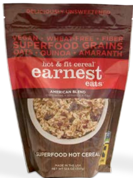
Cranberries, almonds, and seeds galore.