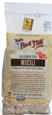
The trifecta: nutty, fruity, and hearty. A must-try.