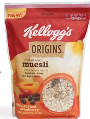
Hot or cold, it's delicious.