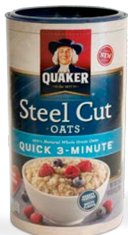
Darn close to real steel cut texture in just 3 minutes.