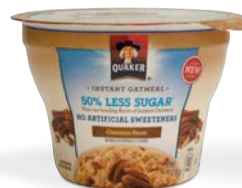
The only flavored oats that mix (less) sugar and (safe) stevia.